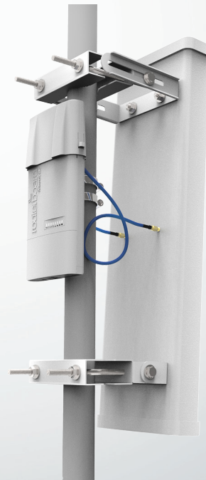
Using the optionally available Flexguide cable, you can use the Basebox with any 3rd party antenna