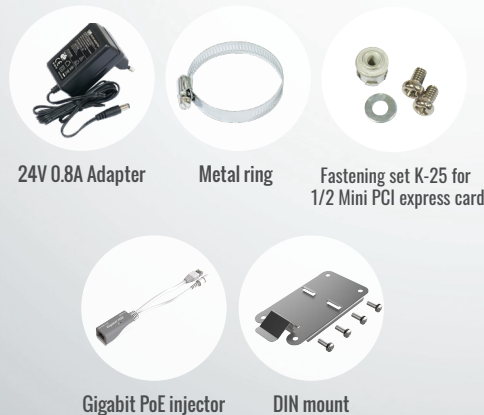
24V 0.8A Adapter